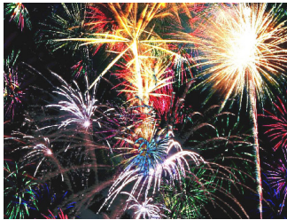
Salute July 4th, 2007

NON-PROFIT ORG U S POSTAGE PAID LAKE FOREST, CA PERMIT NO. 412